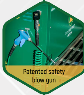
Patented safety blow gun

Our patented designed air gun has a built-in safety feature to prevent debris blowing back at users, also if it becomes blocked or restricted the blow gun will exhaust the air through a relief hole to avoid any injury to the user. Our safety features allows our system to run at a higher pressure (100PSI) which ensures all debris is removed quickly.