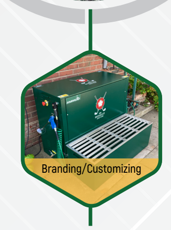
We have two stock colours which are GREEN & BLACK, however our cabinets are available in any colours of the clubs choice